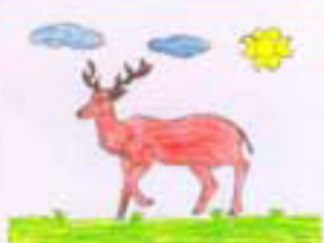
Sohel Pathan III B