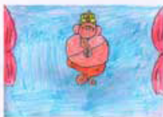
Soha Pathan III B