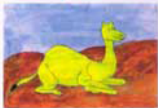
Raj Vurugonda III B