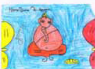
Durva Agawane III A