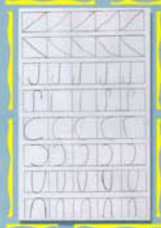
Simran Das Jr.KG. B