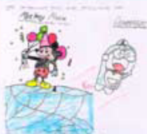
Jyoti Prajapati V