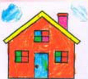
Simran Das Jr.KG. B