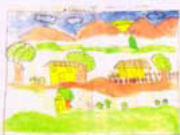
Radnyee Parab IV A