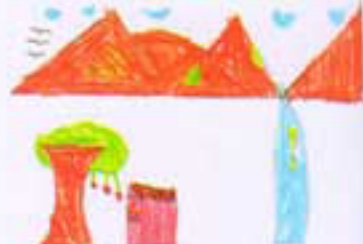
Shivam Sahu I A