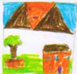
Indronil Pora I B