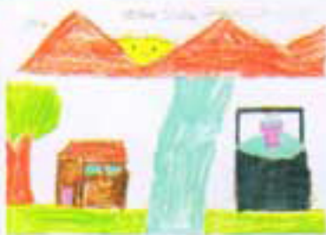
Akshay Ghadge I B