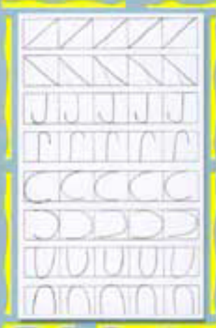
Yash Wadekar Jr.KG. B

1. It is a red cat. 2. It is a fat cat. 3. It is my cat. 4. It runs in the sun. 5. It is the sun. 6. It is my cat.