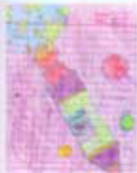
Rushikesh Thorat III B