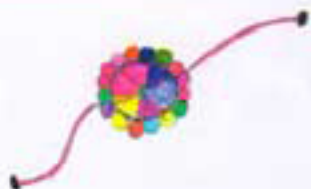
Leela Devasi II A