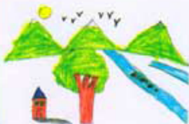
Tanmay Ghanekar I C